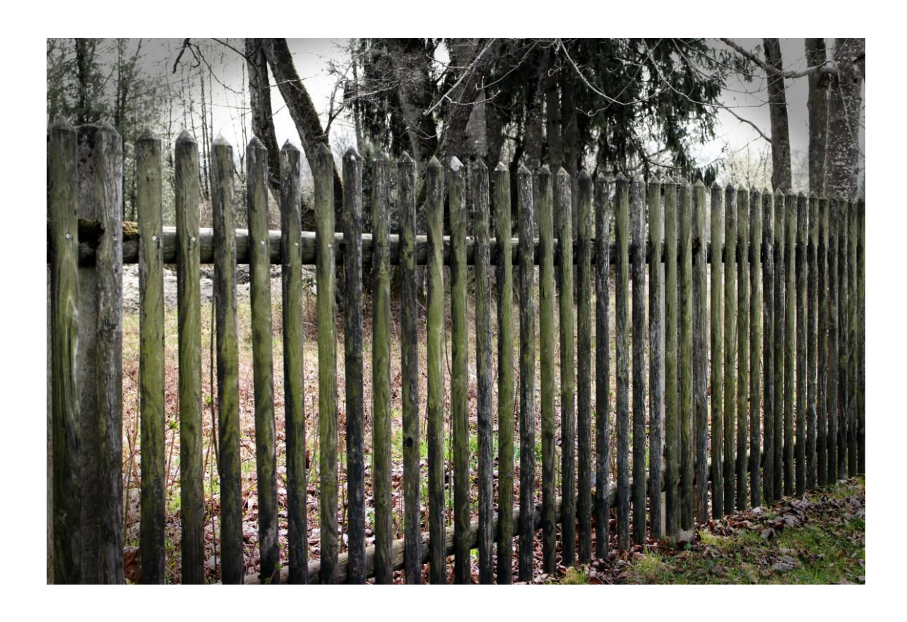
Some fences are meant to say "never." Do you recognize the difference?